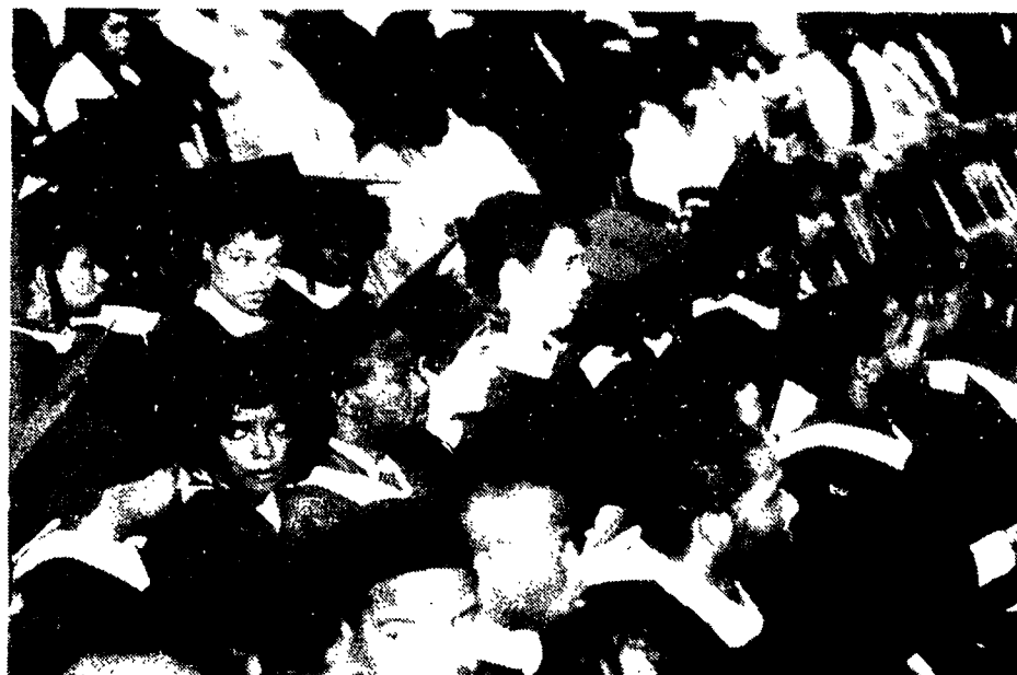
SOME OF THE 145 graduating students, members of the Class of 1985, and their families, friends and sweethearts are seated in Alumni Memorial Gymnasium during the May 5, 1985 commencement exercises.